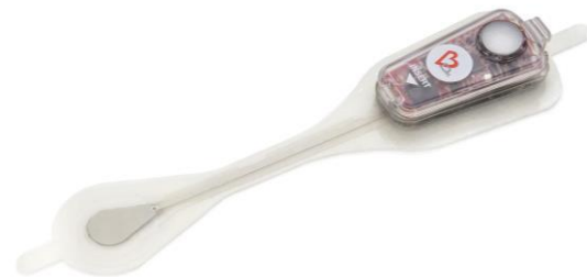
Bardy Diagnostics' CAM™ patch

Frost & Sullivan appreciates BardyDx's advances in novel detection technology leveraging advanced machine learning (i.e., a deep convolutional neural network, which can sequence millions of ECG samples and P-wave centric arrhythmia annotations) that will be